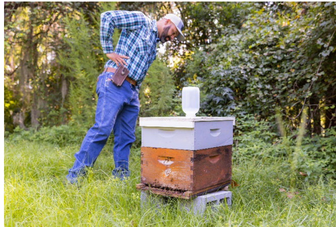
Picture 1: A member of our PPD Team inspecting beehives for signs of YLH activity.

Since our last update, the Plant Protection Division (PPD) has maintained a strong focus on detecting and managing the presence of YLH. Between June 12 and June 25, 2025, PPD captured 40 hornets. An increase from the previous reporting period indicates that YLH activity continues to rise as the season progresses. No new nests were located or eradicated during this time; however, continued monitoring remains critical.